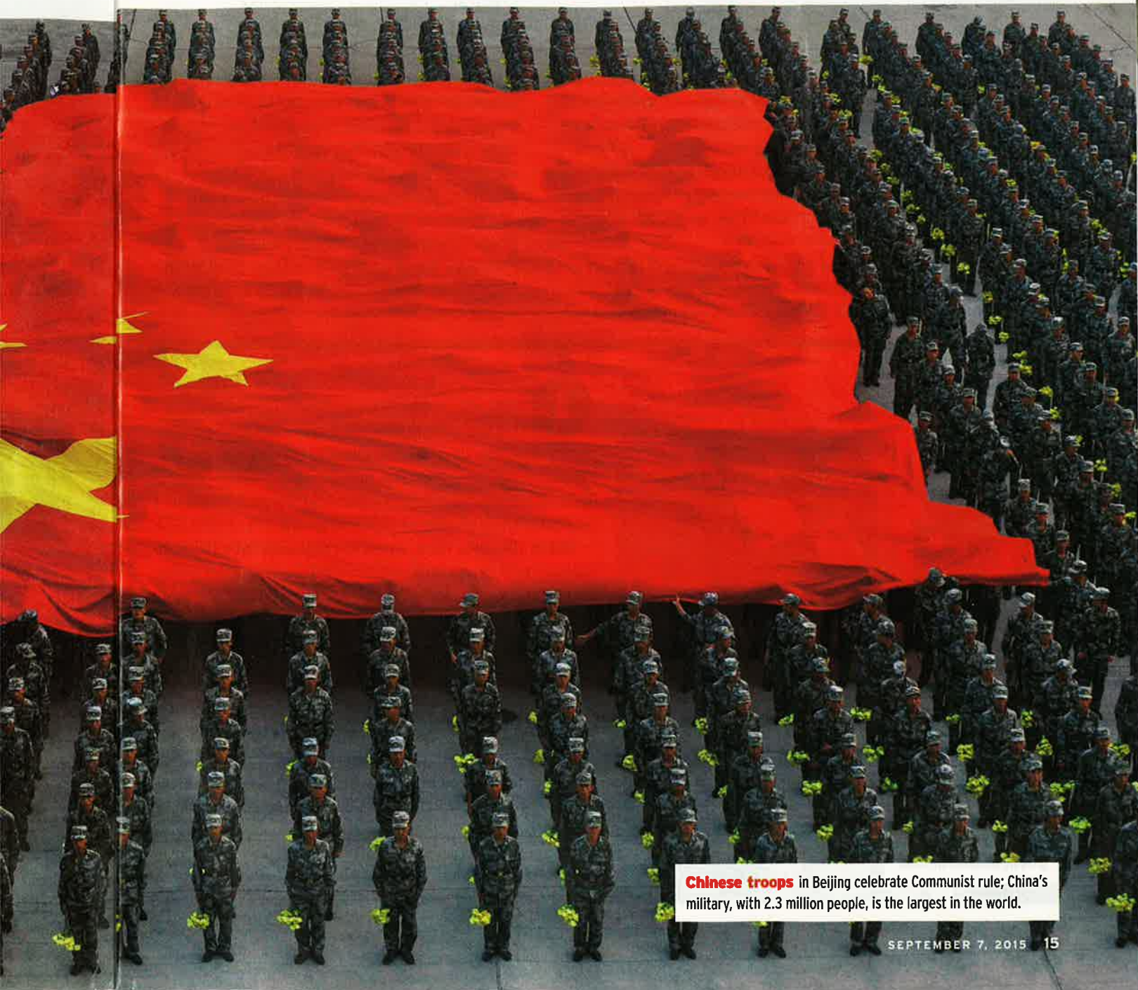
Chinese troops in Beijing celebrate Communist rule; China's military, with 2.3 million people, is the largest in the world.

"There's no doubt that there's a shift in relative power between China and the U.S.," says Stephanie Kleine-Ahlbrandt, a China expert at the United Nations. "They're much closer than they were even 10 years ago."