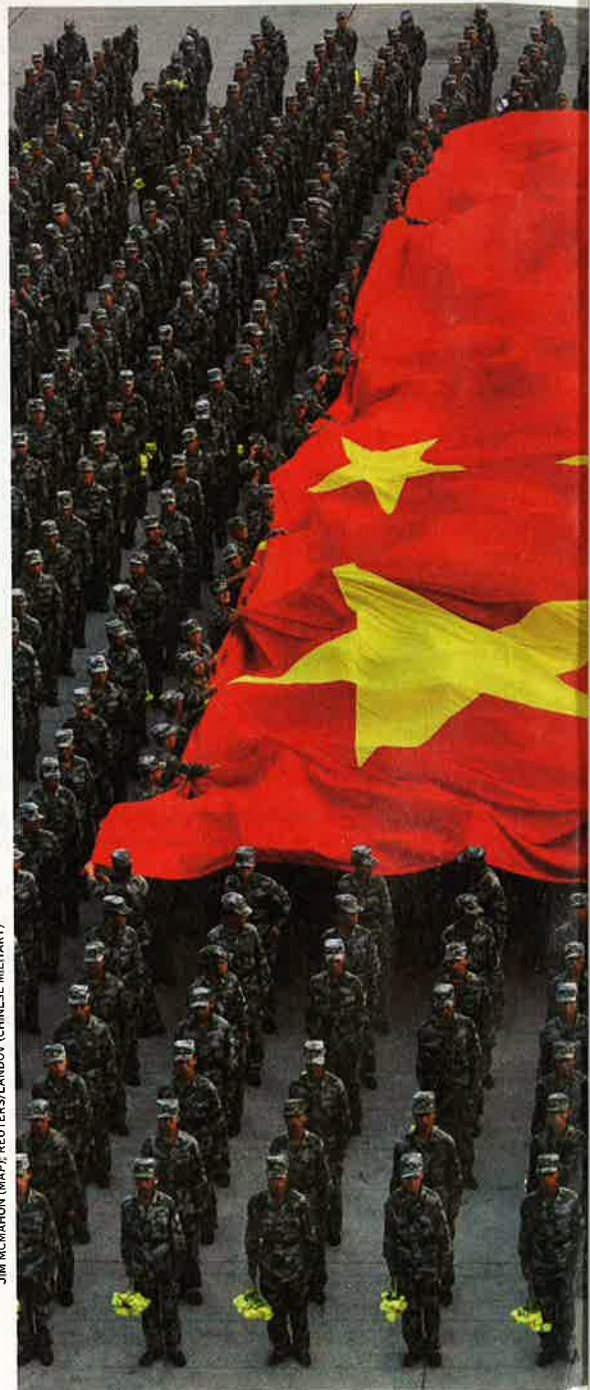
JIM McMAPSON (MAP); REUTERS/LANDOV (CHINESE MILITARY)

14 The New York Times UPFRONT • UPFRONTMAGAZINE.COM