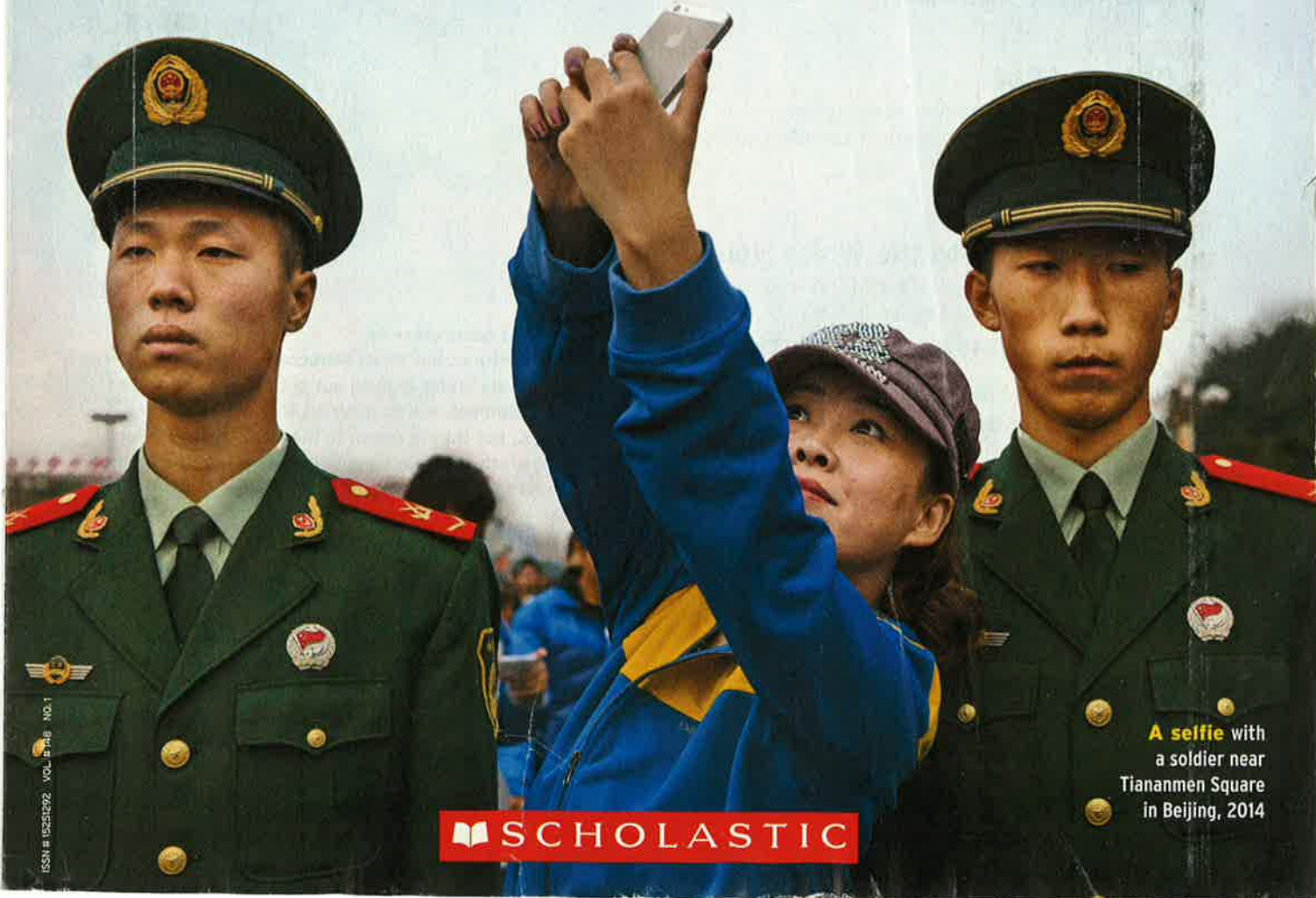
A selfie with a soldier near Tiananmen Square in Beijing, 2014

What you need to know about China's rise and how it affects the U.S.—and your future p. 14